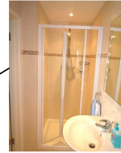
En suite bathroom (shower)