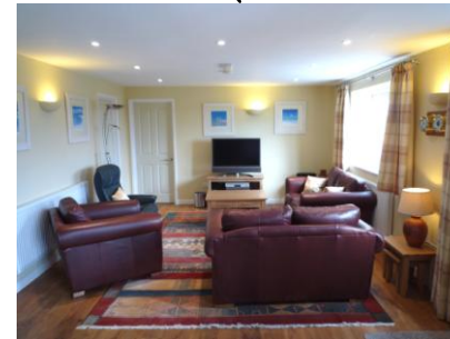
Living space with 37" flat screen TV, DVD + Video Player, Bose stereo radio/CD player