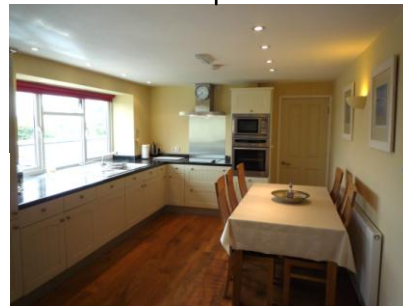
Fully fitted kitchen with ceramic hob, fan oven, microwave, dishwasher & fridge/freezer