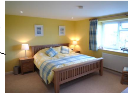
Master bedroom with super-king bed and 26" flat screen TV with ample hanging & drawer space, radio alarm and hair dryer.