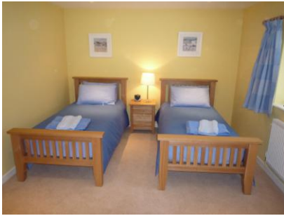
Two twin bedrooms with ample hanging & drawer space, radio alarms and hair dryers

Number 16 comprises a purpose built self contained apartment for six people, finished to a very high standard. It is located in a private no through road with views of Porth Mellon Beach on the beautiful island of St. Mary's.